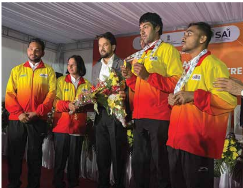
Mr Anurag Singh Thakur, Hon'ble Minister for sports with the CPSFI team