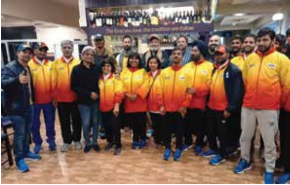
At the restaurant

for sightseeing where they visited the Torre de Belém (Belém tower) and a little shopping experience before heading for dinner to an Indian restaurant, Cinnamon. Dinner was followed by some unwinding with dance and music. The athletes were later dropped off at the airport for the return journey from Lisbon-Frankfurt-New Delhi.