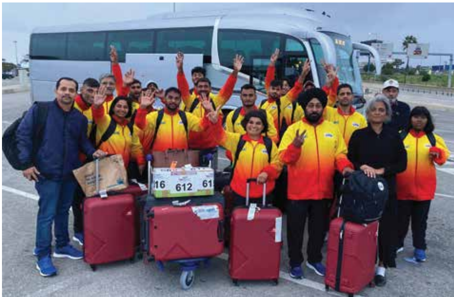
The team on arrival at Faro airport