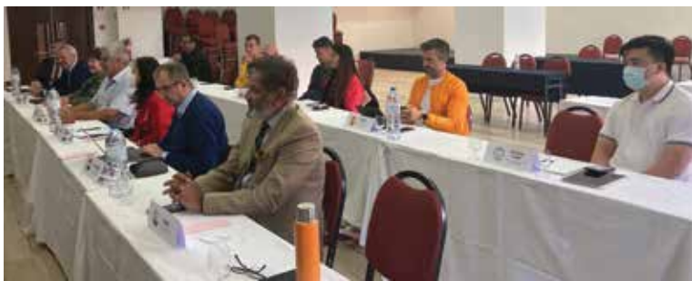
CPISRA General Assembly