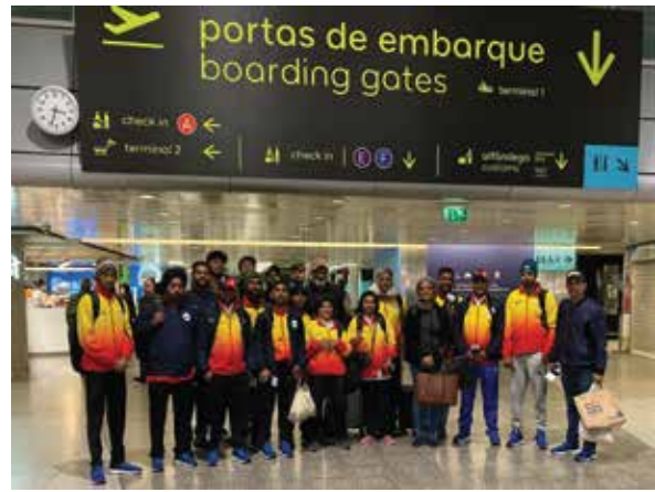
Lisbon airport - return journey