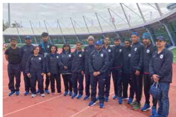
Athletes training at the beach and in the stadium