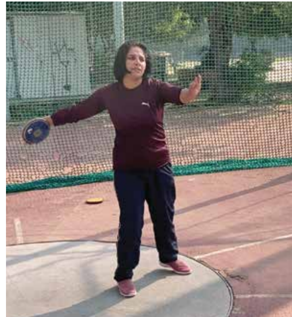
Mukhta F37, shot put & discus throw