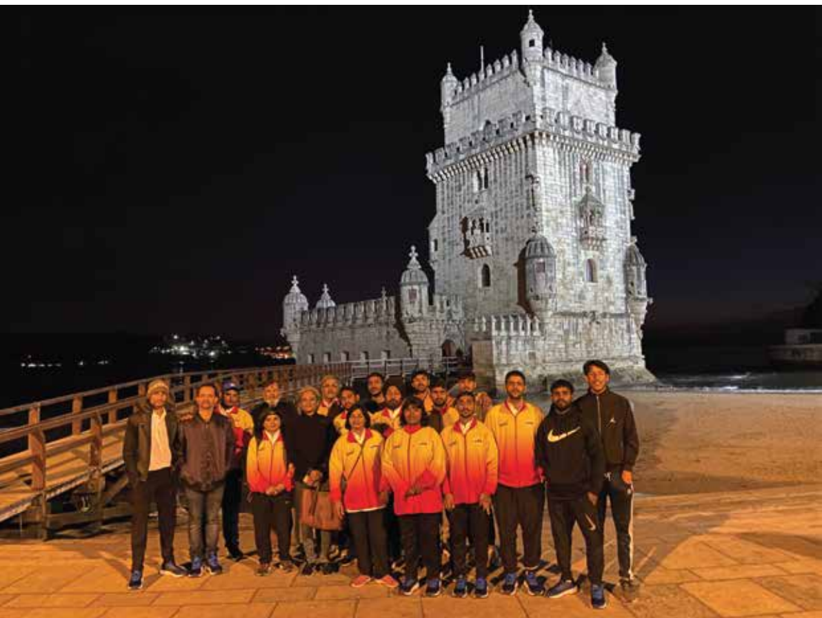
The team at the Torre de Belém (Belém tower)