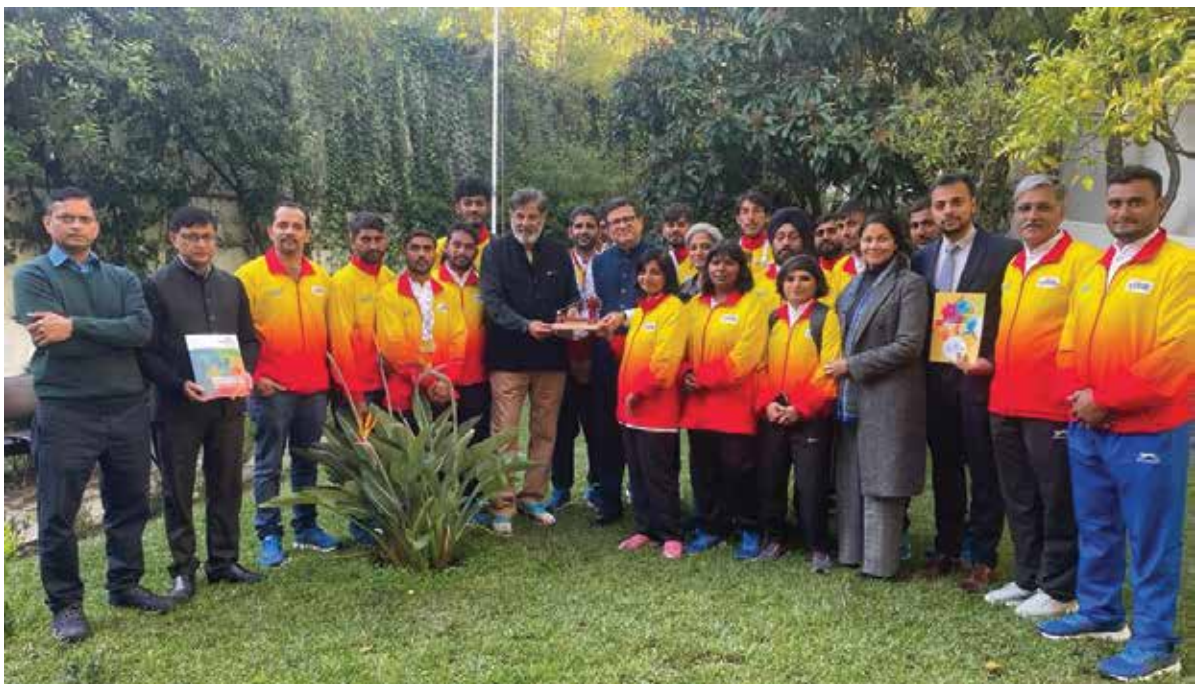
The team at the Embassy